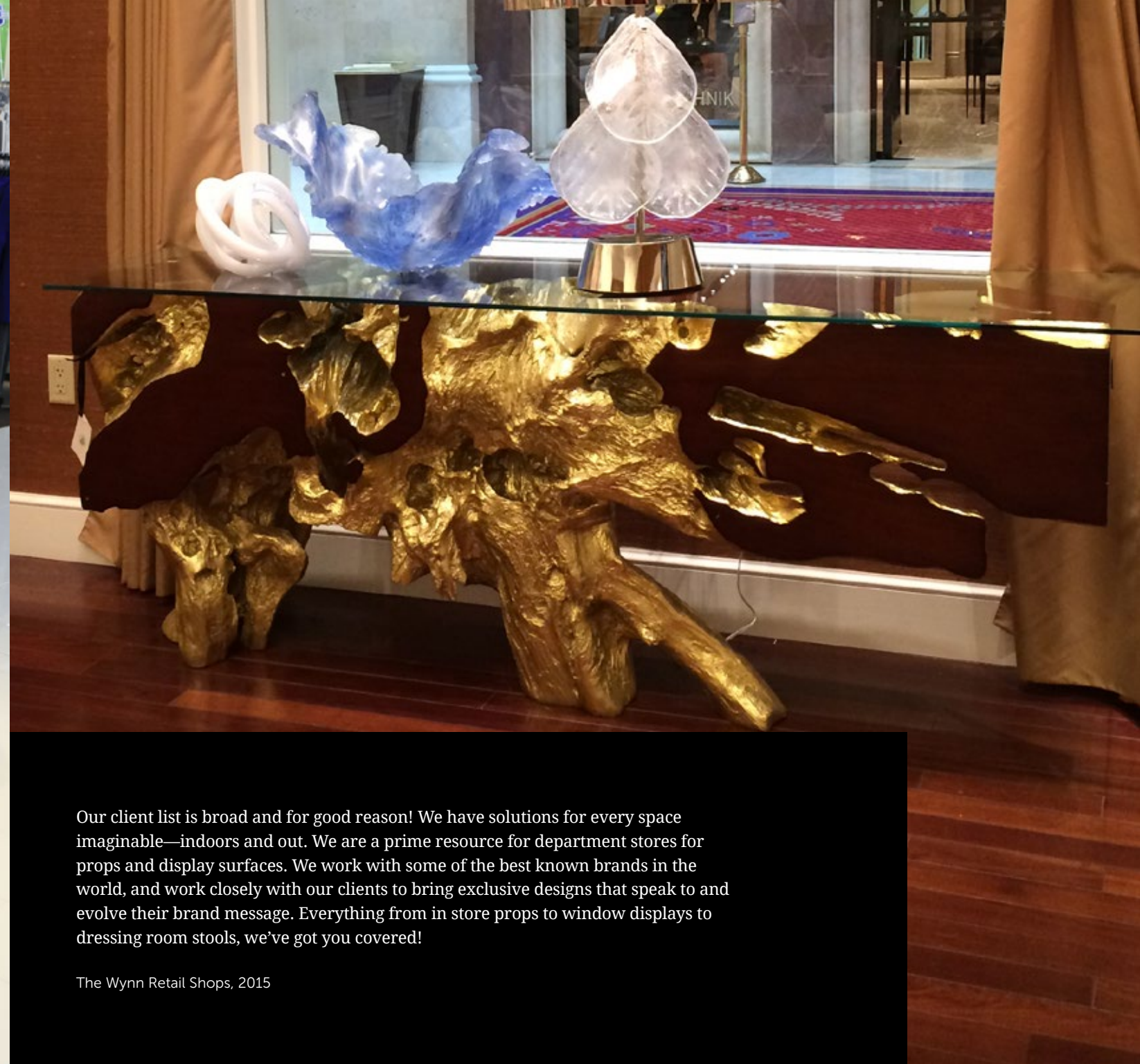
Bon Ton Stores, 2016

Our client list is broad and for good reason! We have solutions for every space imaginable—indoors and out. We are a prime resource for department stores for props and display surfaces. We work with some of the best known brands in the world, and work closely with our clients to bring exclusive designs that speak to and evolve their brand message. Everything from in store props to window displays to dressing room stools, we've got you covered!